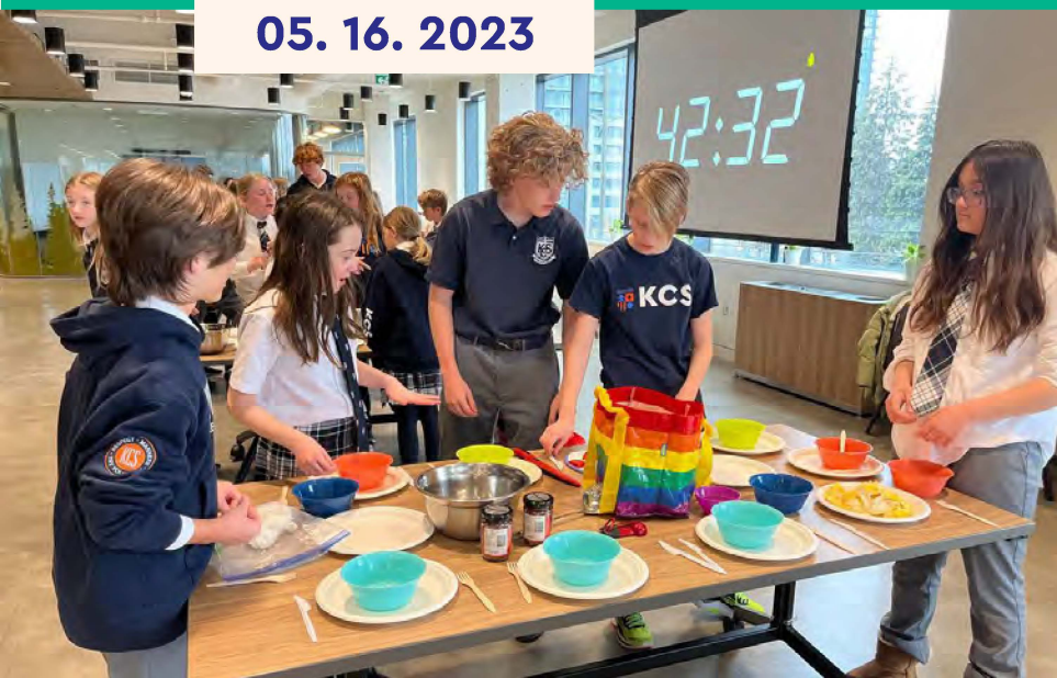
KCS MasterChef Competition