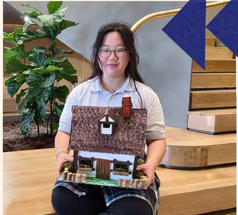
Student Path Project