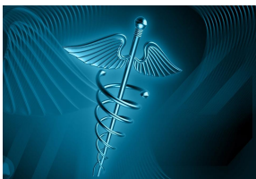
Health Science Technology