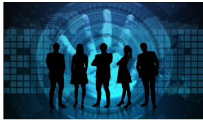
Business, Management, and Education