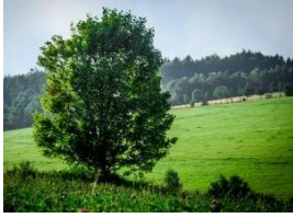
Agriculture, Food, and Natural Resources

All River Valley High School Course Offerings align with Career and Education Workforce Standards. Each Pathway is associated with the Future Readiness Career Clusters.