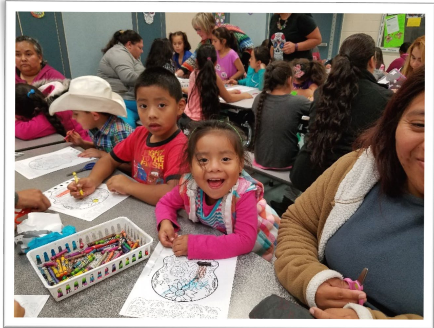
Parents & siblings engage with our schools at theme nights!