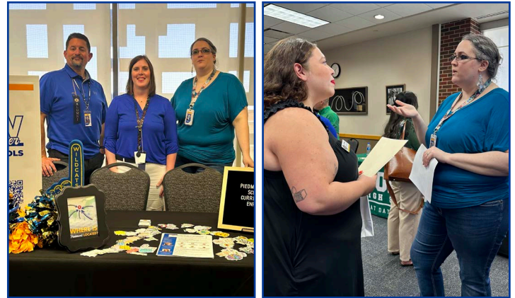
MEMBERS OF THE PPS RECRUITMENT AND RETENTION COMMITTEE ATTENDED THE UCO JOB FAIR TO SPEAK TO STUDENTS ABOUT CAREERS AT PIEDMONT SCHOOLS.