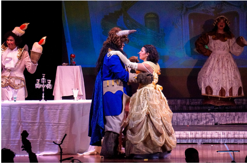
Belle and the Beast dance before a jubilant crowd during the musical's opening night.

On Thursday, April 27th, Bergenfield High School presented its first musical in several decades with its presentation of "Beauty and the Beast." The event continued through Saturday, April 29th.