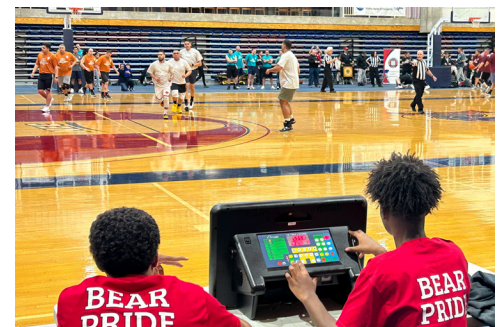
BHS students keep score at the game.

Students from Bergenfield High School volunteered at the Bergen County PBA charity basketball game at the Rothman Center at FDU on March 16th. All proceeds from the event went to the Tomorrows Children's Fund, which aids children in treatment for cancer.