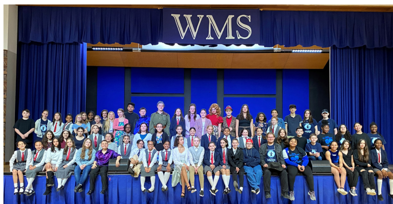
Middle school students performed in Roald Dahl's Matilda The Musical JR.

The Aspire Program provides students in all grade levels with various classifications, daily living, communication and academic skills. Small groups and individualized teaching as well as other special education services allow each student's needs to be met. An additional class will be added at Taft to meet the growing needs of the entire Washingtonville community.