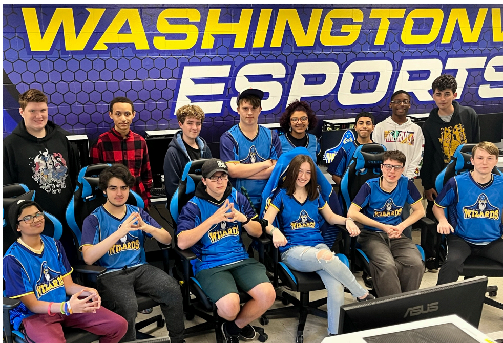
The high school has one of just two Esports programs in Orange County. Students learn valuable skills for competitive college esports teams as well as business and technology careers through the elective and school team.

The Washingtonville Central School District has 3,922 students enrolled at Little Britain, Round Hill and Taft elementary schools, Washingtonville Middle School and Washingtonville High School. The district has a graduation rate of 96% and provides progressive and innovative academic and extracurricular programs for its students to educate them in 21st century skills to ensure they are college and career ready.