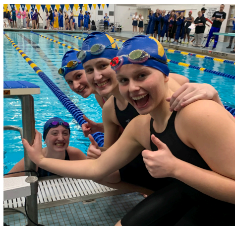
The boys and girls swim and dive teams were recognized in both state and regional competitions.

Science 21 , a standards-based science program for the 21st century, is now fully implemented for grades K-5 in the district. It will prepare students for new science investigations and exams that will start next year.