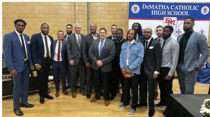
The 2006 basketball team.

The DeMatha Hall of Fame was established in 1990 to recognize alumni who have distinguished themselves in their careers, communities, and other activities since graduation. In addition, recognition is given to athletes, coaches, and team members who distinguished themselves athletically at DeMatha and beyond. Nominations for induction are accepted by the school, and a committee made up of Trinitarians, alumni, parents, and friends representing all eras of DeMatha vote on those nominations.