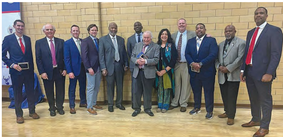
The individual inductees stand together for a photo after the ceremony.

While DeMatha will always be playing catch up in its Hall of Fame due to the numerous members of the DeMatha community, alumni, and teams deserving to be inducted, we would like to once again congratulate the members honored this year as well as all the Hall of Fame members that they are joining.