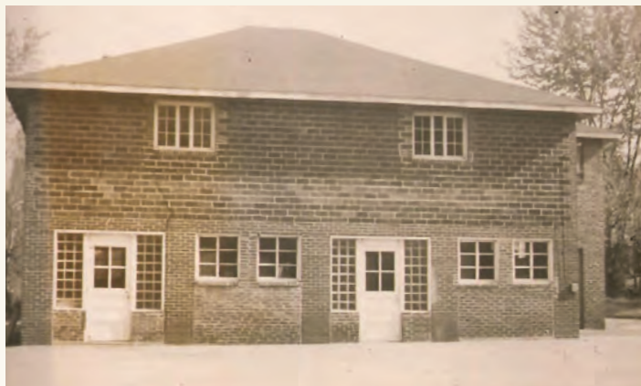
The original Fort Necessity

Program. As more and more DeMatha students choose to pursue art, engineering, and robotics, the need for a modern and updated space became more apparent.