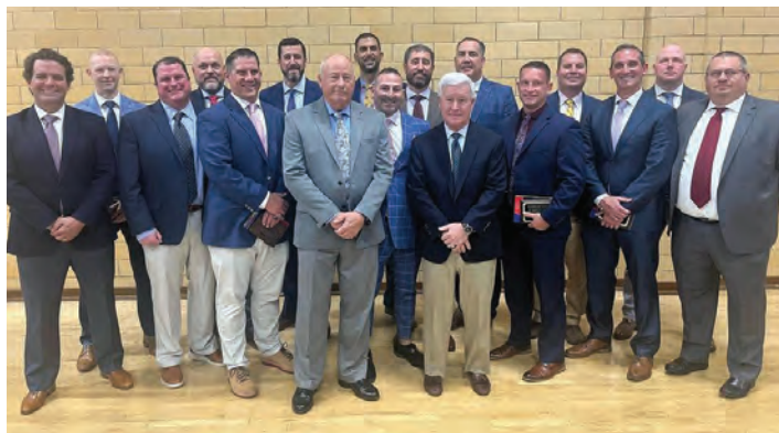
The 1996 lacrosse team.