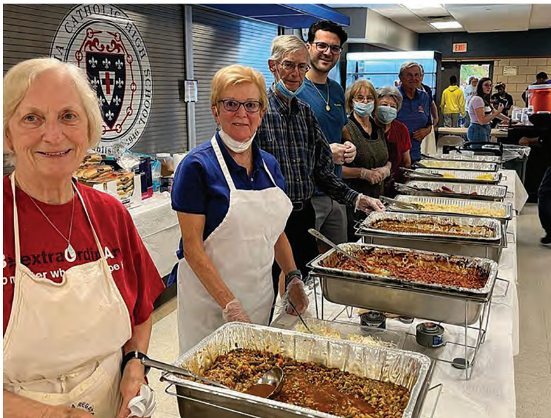
The Senior Boosters Crab Feast was held at DeMatha in September. This was the first one held since 2019! The first-ever Crab Feast was in 1971.