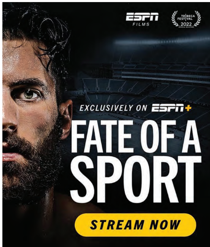
"Fate of a Sport" was featured on ESPN+, chronicling Paul Rabil's '04 journey to creating the PLL.