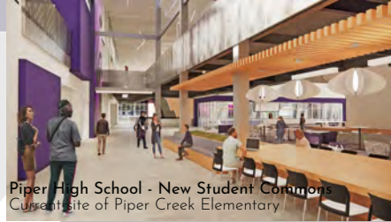
Piper High School - New Student Commons Current site of Piper Creek Elementary