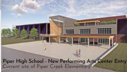
Piper High School - New Performing Arts Center Entry Current site of Piper Creek Elementary