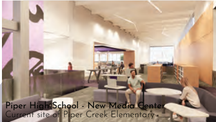
Piper High School - New Media Center Current site of Piper Creek Elementary