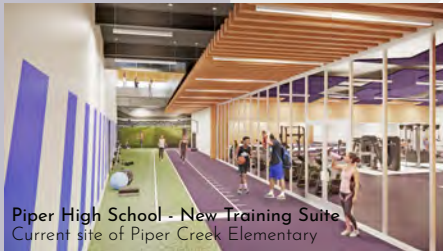
Piper High School - New Training Suite Current site of Piper Creek Elementary