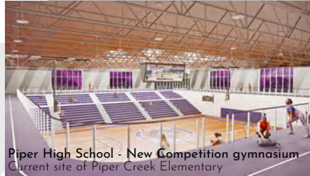
Piper High School - New Competition gymnasium Current site of Piper Creek Elementary