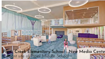
Piper Creek Elementary School - New Media Center Current site of Piper Middle School