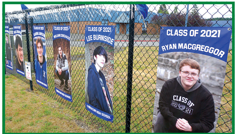
Banners honoring the Class of 2021 lined Chimacum Schools’ fence.