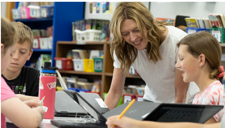
Students at Wyandot Run Elementary School work on Book Club evaluations developed to support student-centered learning and foster curiosity.

tiered system of support (MTSS) and a culture-building framework of positive behavioral interventions and supports (PBIS). During the 2022-2023 school year academic supports expanded by adding a Math Specialist to the current Literacy and Gifted Specialist teams in each elementary and middle school.