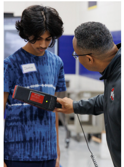
The Ohio State University Wexner Medical Radiology staff demonstrate medical imaging technology to middle school students.

Olentangy: BridgED was formed through an inaugural partnership between BridgED, the Educational Service Center of Central Ohio (ESCCO) and Olentangy Schools.