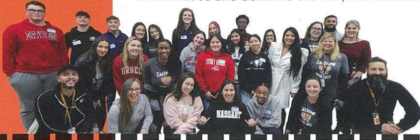
◀ Visiting graduates with White Plains staff and administrators

As part of our mission to ensure all White Plains students are college and career ready, Eastview hosted its schoolwide AVID Steps to Success Program in December, in-person for the first time in three years! About 20 White Plains graduates who are now in college or the military came back to the District to talk with sixth graders about opportunities beyond high school. The visiting alumni answered students' questions about choosing a path after high school, getting ready for college, what classes and dorm life are like, and much more.