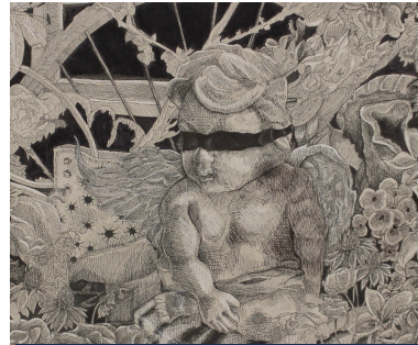
Chloe Custer: "Love is Blind" 1st place