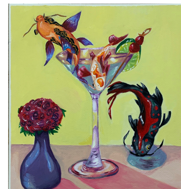
Ethany Rogan: "Surreal" 2nd place