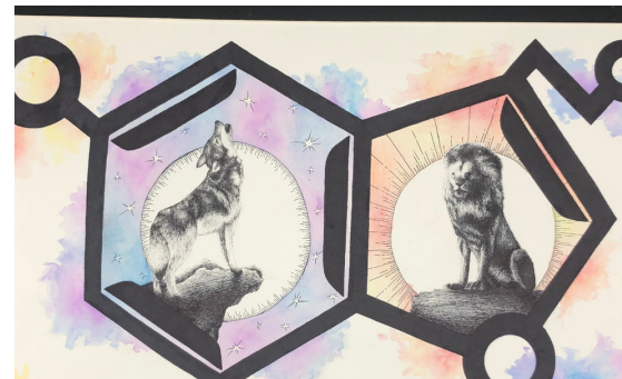
Riley Bastian: "Night and Day" - 3rd place