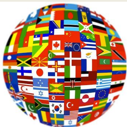
Cultures all over the world