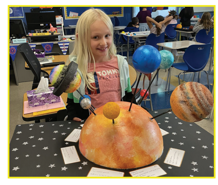
For this year's first Pick-a-Project activity, students researched one of several topics, demonstrated an understanding of math concepts and presented their findings to the class.

Most students selected "The Planets" as their topic which required them to research the size of and make a model of the eight planets and the Sun. Students then wrote information about each planet's radius and compared their sizes, using accurate addition and subtraction to find the difference in size between one planet larger and one planet smaller in comparison to the Earth. This marked the first of several "Pick-a-Project" activities that students will complete during the school year. Throughout the learning process, the students demonstrated creativity, hard work and a strong commitment to learning.