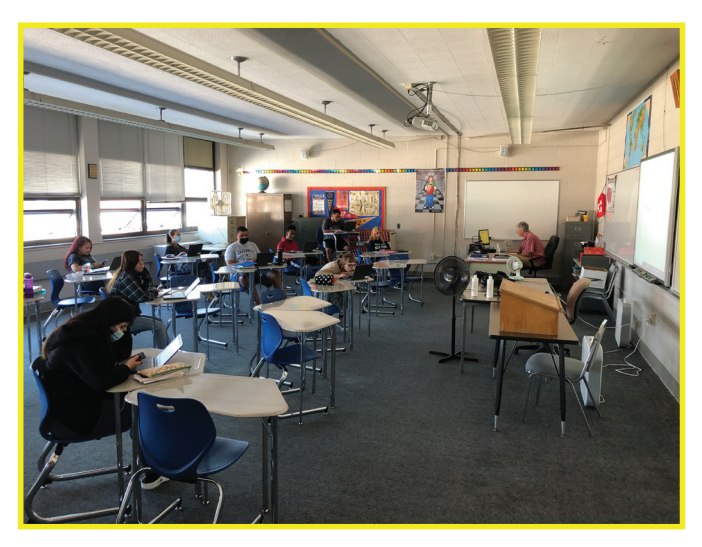
Ongoing carpet and classroom furniture replacement for grades 4-7 and at Brooklyn High School are part of planned district capital improvement projects.

As part of a strategic effort to ensure that facilities are properly maintained and upgraded, the Brooklyn City Schools contracted with GPD Group in the fall of 2021 to conduct a facility study to assess building conditions and needs at Brooklyn High School and Brooklyn School (PK-7).