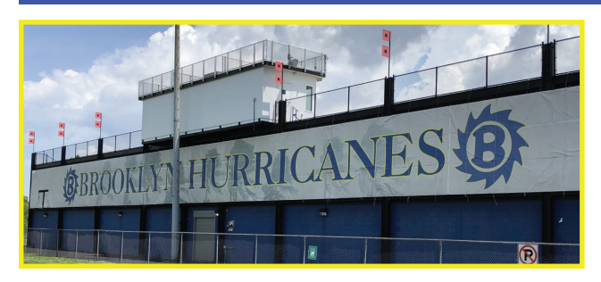
Last renovated in 1996, the resurfacing of the track at Brooklyn Stadium began in early July and is expected to be completed by mid-September 2022.

Brooklyn Stadium has witnessed many exciting and memorable track and field events over its proud history. In addition, many community members utilize the outdoor track to practice a healthy and active lifestyle outside of district events. As part of an ongoing district capital improvement initiative, the Brooklyn City Schools has contracted with Vasco Sports Contractors to resurface the athletic track at Brooklyn Stadium. The first phase took place from July 5th – July 15th and will be followed by a second phase starting after August 22nd. The resurfacing project is expected to be completed by mid-September of 2022. Last renovated in 1996, the ongoing track replacement will help to ensure that the track surface is kept in optimal condition for students and the greater community to enjoy.