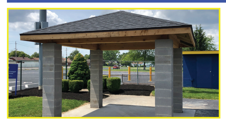
The new pavilion at Brooklyn Stadium was constructed by students from the Polaris Construction Trades Program and financially supported through a donation from the Brooklyn Athletic Boosters Club.

The Brooklyn City Schools community will be able to enjoy a brandnew pavilion at Brooklyn Stadium during the fall of 2022 thanks to a partnership with Polaris Career Center and the Brooklyn Athletic Booster Club. Students from the Polaris Construction Trades Program began work on the pavilion during the spring and finished shortly before the end of the school year. The free-standing pavilion will improve the function and aesthetics of the Brooklyn Stadium complex. Funding for the project was made possible through the generous financial support of the Brooklyn Athletic Booster Club. On behalf of the Brooklyn City Schools, congratulations to all participating students for their outstanding work and thank you to the Polaris Career Center Construction Trades Program, various local business partners, and the Brooklyn Athletic Booster Club for their contributions and support.