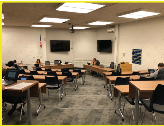
The newly renovated Community Room/ HS Room 173 is used by students enrolled in the Brooklyn Digital Learning Academy and hosts all BOE meetings.

As part of a strategic effort to ensure that facilities are properly maintained and upgraded, the Brooklyn City Schools are in the process of completing a wide range of capital improvement projects throughout the entire district campus. Work on the capital improvement plans began during the 2020-21 school year and include smaller-scale improvements such as new landscaping and building signage to larger projects including repaved lots, roof repairs, and more.