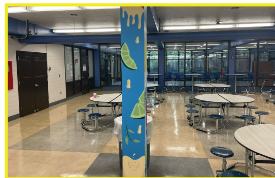
In addition to new tables and freshly painted walls, the HS cafeteria features column murals created by students.

An old fuel storage tank was removed from Brooklyn's bus garage while all district parking lots have been repaved. The Brooklyn City Schools are also in the process of undergoing a Facility Study conducted by GPD Group to assess additional facility needs. Altogether, the ongoing improvements and maintenance across the campus of the Brooklyn City Schools represents the district's commitment to providing a learning environment that is safe and gives students opportunities to succeed! Stay tuned for future updates from the Brooklyn City Schools.