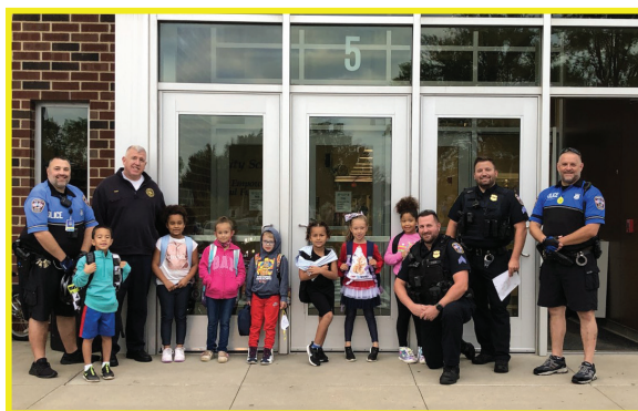
Brooklyn's safety forces joined Brooklyn students on a beautiful early fall day for the annual Community Hike & Bike event.

In a strong display of community pride, Brooklyn showed their support for local safety forces by participating in a Community Hike & Bike on Wednesday morning, October 13, 2021. As part of the event's theme of Let's Bike It/Hike It with a Hero, participating students were encouraged to wear red, white, and blue apparel and meet at one of three community locations, including Marquardt Park, Brooklyn Fire Department, and Brock Park. Students, family members, and district staff were joined by members from the Brooklyn Fire and Police Departments as they walked or biked from each meeting point to school. The Community Hike & Bike was part of the annual celebration of Walk to School Day sponsored by the Ohio Department of Transportation's Safe Routes to School program. For each day of the week-long celebration, students were encouraged to walk or bike to school and participate in a variety of themed activities. The Brooklyn City Schools thanks the Brooklyn Fire and Police Departments for their participation and continued support of the district. Thank you to all participating students for their support of our local safety forces and school spirit!