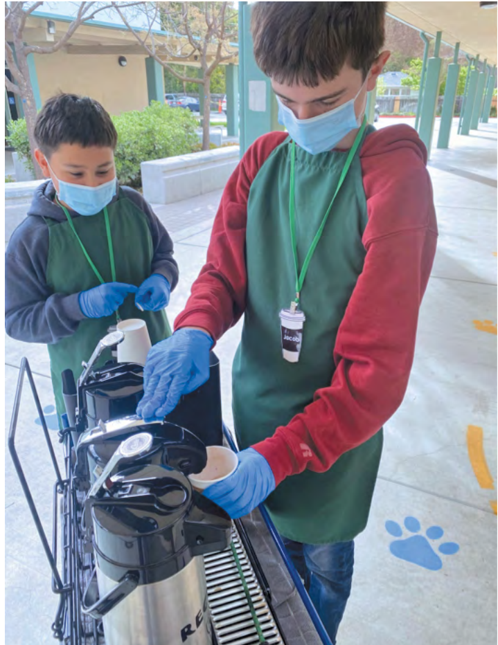
Students preparing the Futures Coffee Cart.

some extra treats to our staff with their mobile coffee “business.” As part of their community-based instruction, students take a field trip to shop for supplies and ingredients at our local market during the week. In the Futures kitchen, our young chefs follow recipes to prepare tasty items such as muffins, Rice Krispies Treats, and our famous coffee cake. Each Friday, these skilled baristas visit teachers and staff to accept orders and prepare personalized drinks while practicing monetary change distribution while having wonderful conversations. The Futures Coffee Cart is truly a highlight of the week at Greene Middle.