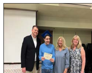
Region 14 Transition Academy graduation