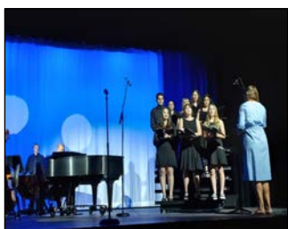
Spring Concert NHS Orchestra & Concert Choir