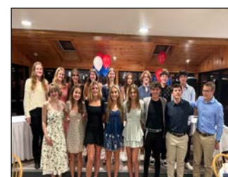
Top 10% at NHS recognized at April banquet