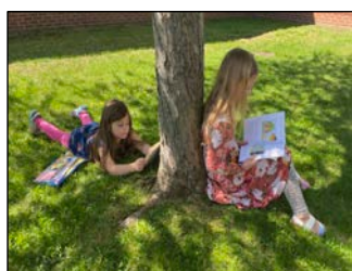
BES Earth Day outdoor reading classrooms