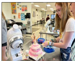
Cake Wars in 8 th grade culinary at WMS