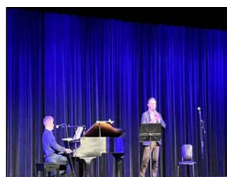
World class musicians play for NHS & WMS music students