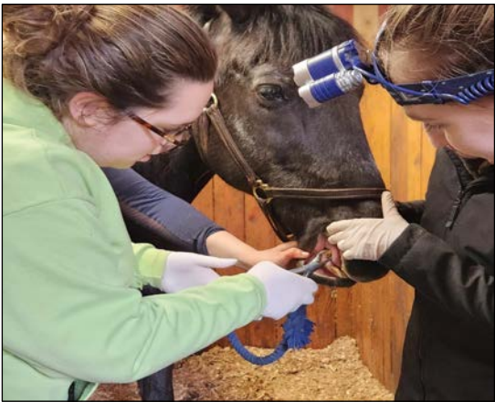
Students in the Agriscience Program at Nonnewaug High School welcomed experts from Fairfield Equine for yearly vaccine and dental check-ups for the horses. Students worked alongside technicians to get some hands-on experience helping to remove some extra plaque on one of their horse's teeth.