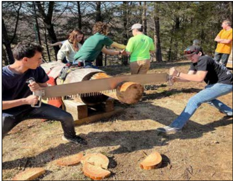
Members of the Woodbury FFA Timber Team at Nonnewaug High School began practices for their upcoming spring competition. The Timber Team will host the second annual Timber Team Trials on May 7. They will compete against rival high schools Wamogo and Woodland.