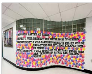
Words Matter school climate Initiative at WMS