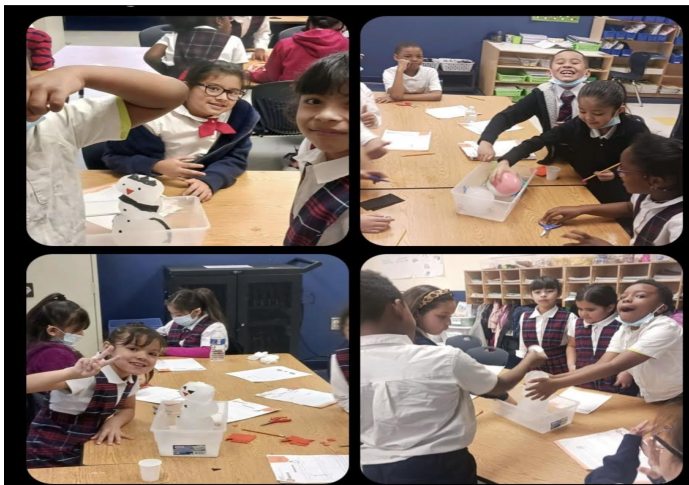
2nd Graders Engaged in Their Science Projects on Liquids & Solids!