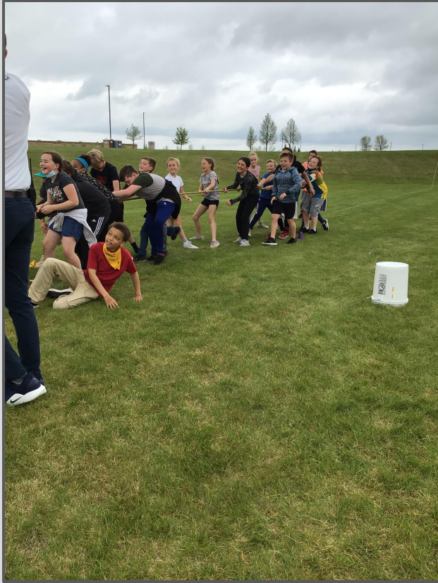
4th Grade Tug of War