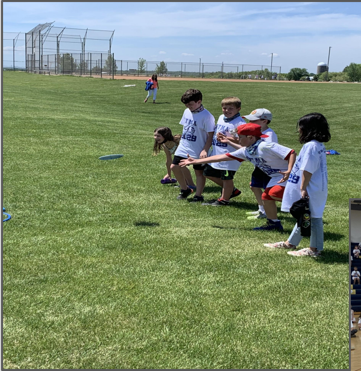
4th Grade Assembly and Frisbee Golf