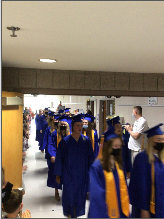
Big Woods Seniors' Parade