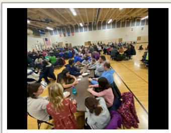
700 PEOPLE IN ATTENDANCE