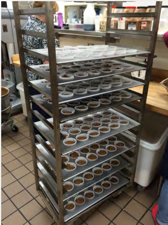
Muffins being scooped and prepared for baking