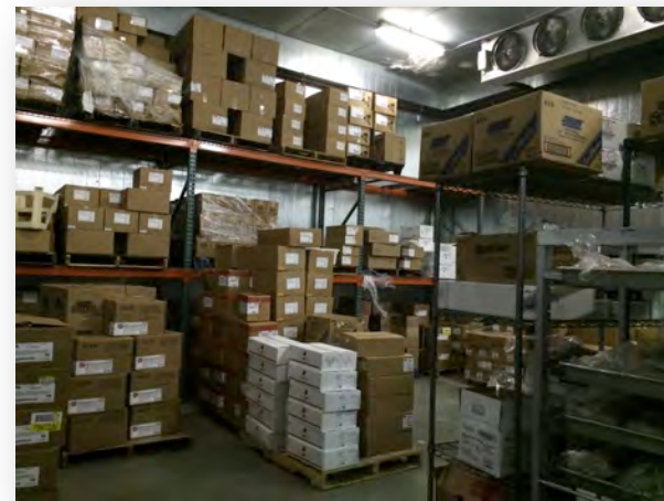
Inside of the CK freezer