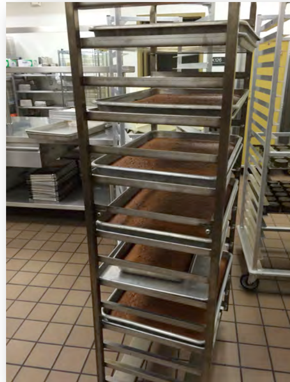
Pirate cake cooling- whole wheat sweet potato and spice cake