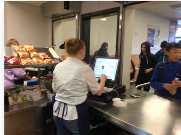
A cashier helps ring up a student meal

Lunch time is huge at the high schools. We have open campuses and one lunch period. We have 5 serving lines open, four in the main lunch line area and 1 at a separate café where we have a grab and go menu to help students and staff who need to eat quickly and/or cross campuses.