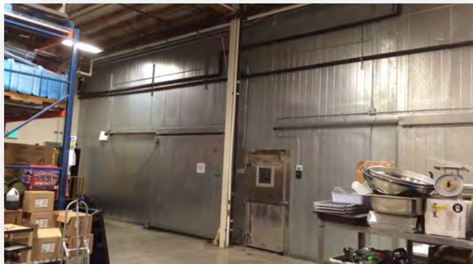
Central Kitchen Freezer

The Central Kitchen (CK) is located in Hamlin Park. All complex food preparation takes place at this location. Some of the large production items that are prepared here include: vegetarian chili, turkey meatloaf, turkey and gravy, sauces, the fresh vegan salads on the salad bars, muffins, cookies, and more. The CK is the only kitchen that handles raw meat.