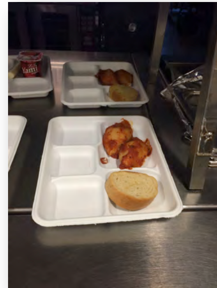
Whole grain stuffed pasta shells, whole grain garlic toast