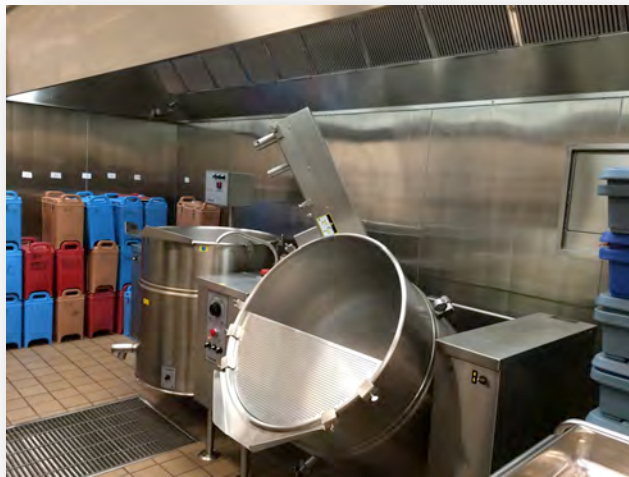
Steam Jacket Kettle

The cooking area of the CK is where we make soups, sauces, gravy, and more.