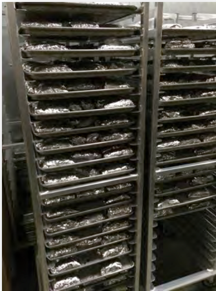
Part of the 1500 hand rolled burritos the CK made on 10-30-15

The CK was built in 2010 and contains state-of-the-art equipment.