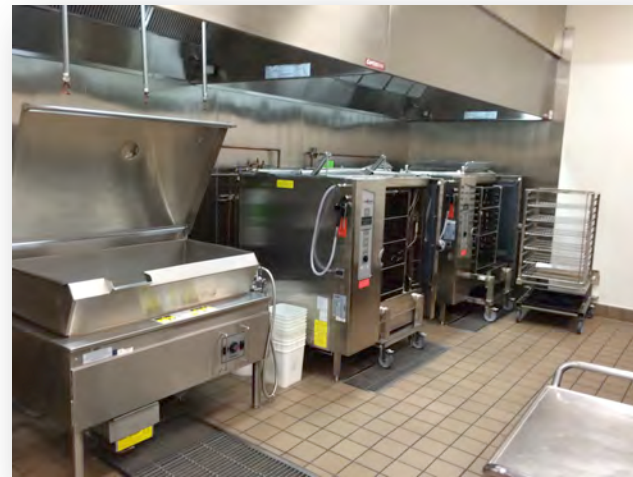
Tilt Skillet & Ovens