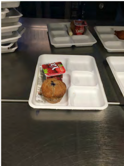
Scratch-made blueberry muffin, Yami yogurt, string cheese

We have two entrees daily, one of which is vegetarian