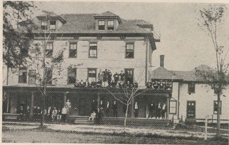
OLD BOYS' DORMITORY — KNOW ANYBODY HERE?