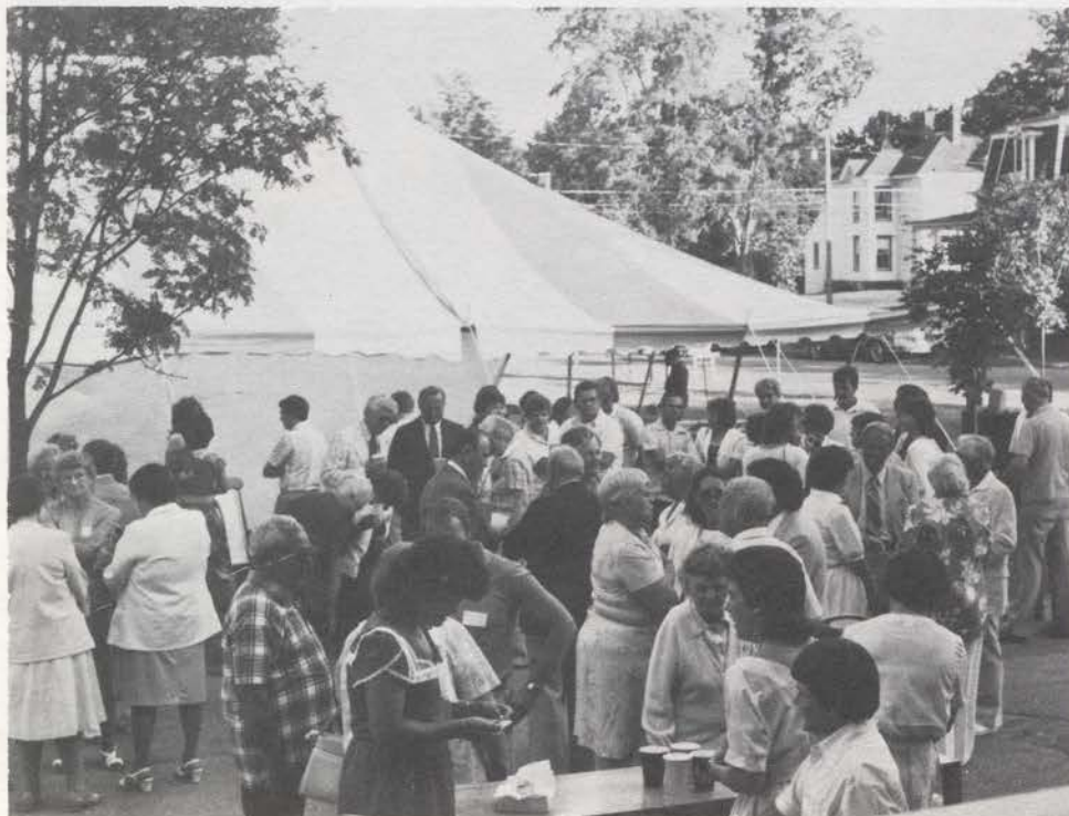
Alumni gather for the reunion banquet.