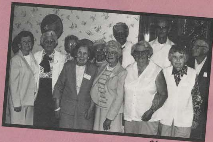
Class of 1930