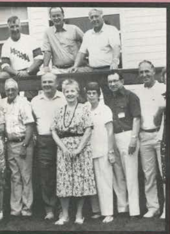
Class of 1949