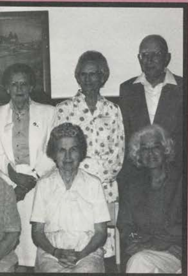
Class of 1925