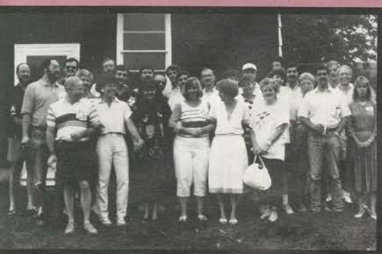
Class of 1969