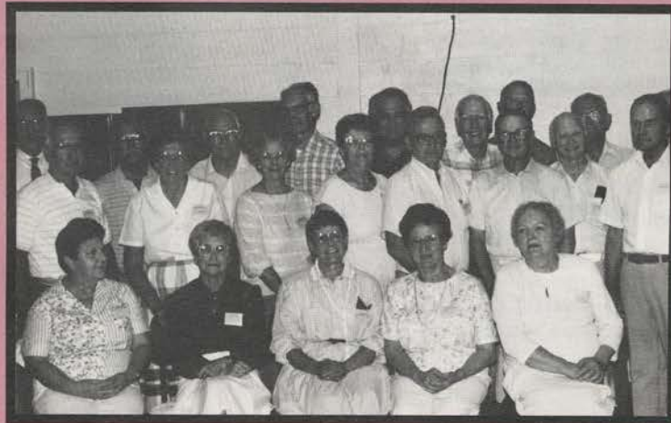
Class of 1939