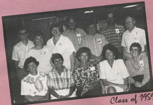
Class of 1959