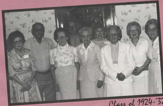
Class of 1924-'32