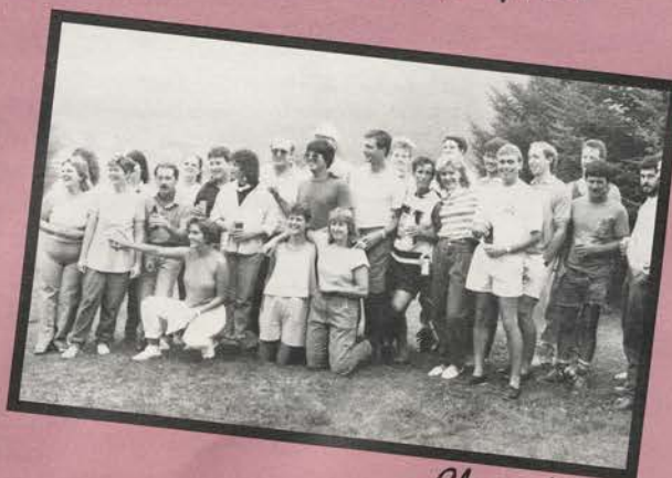
Class of 1979