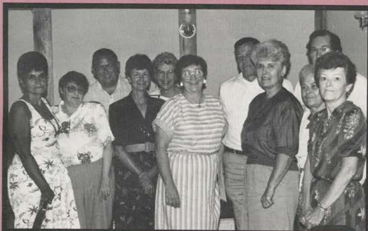
Class of 1954