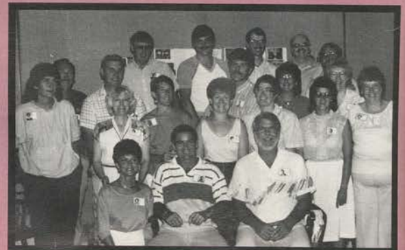
Class of 1964