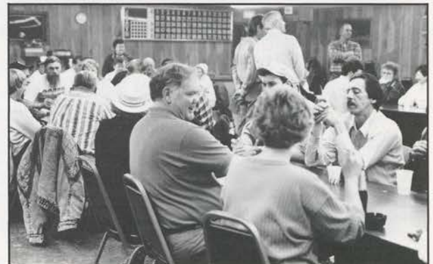
Some concentrated on playing cards; some concentrated on the Maine championship hockey game. We know who won!