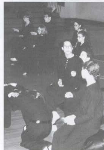
The group in a powerful scene of "Wings".

On March 7-8, 1997, the MCI drama team won the North Central Regional Division II Drama Festival hosted by Ellsworth High School's Theater of Mad Jesters. The festival, co-sponsored by the Maine Principals' Association and the Maine Drama Council, was one of eight regionals held throughout the state at various school sites. The win allowed MCI to advance to the State Division II Festival held at Hermon High School on March 21-22, 1997.