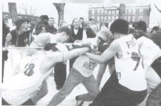
The junior boys are trying their best at Winter Carnival 1997