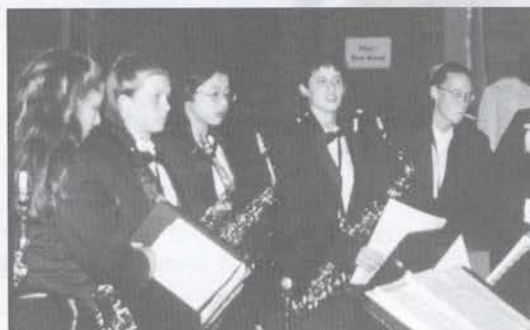
Jazz Band performing at Homecoming