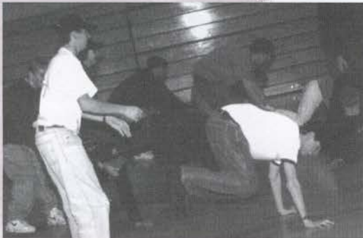
Working together - the main focus of the student council day