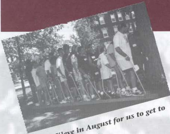
Camp Kieve in August for us to get to know one another