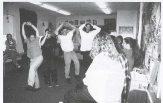
Communication - another important part of the day