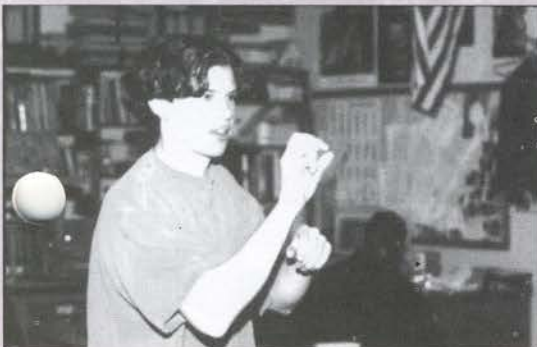
Working in a small group in a game of charades