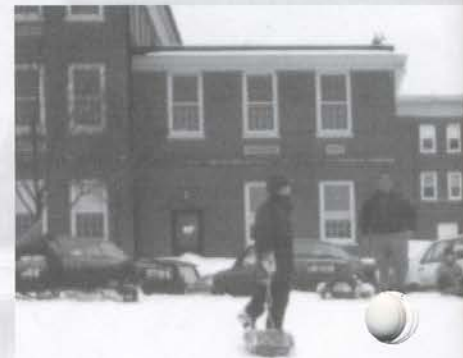
Some of our future students enjoy sliding down the hill