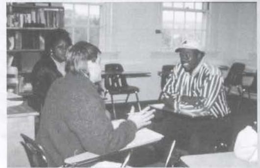
Parent/Teacher Conferences during Homecoming Weekend