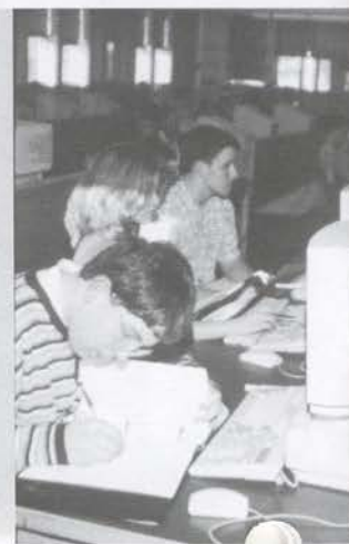
It's another day of learning