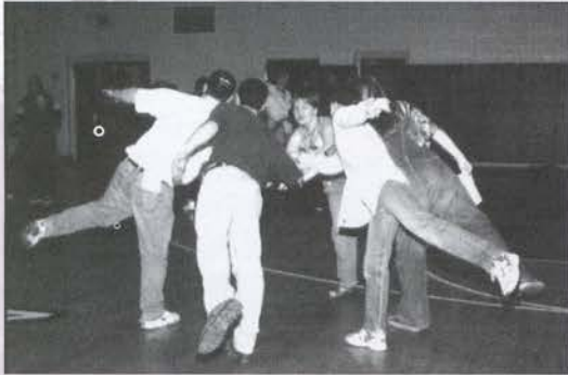
Everyone loves the game of "captain's calling".

It was a busy and worthwhile day and the Student Council deserves a "thank you" and a "job well done."