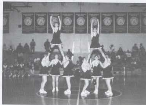
The cheerleaders showing their routines