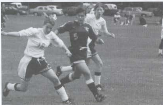
Girls Soccer during Homecoming Weekend