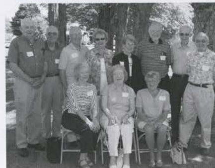
Class of 1946/47