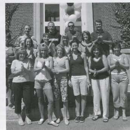
Class of 1985