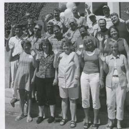
Class of 1980