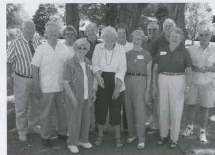
Class of 1948

Friends reunited at Reunion 2005 and they celebrated throughout the day and some into the night. Many enjoyed their weekend so much that they've already made plans to attend next year's reunion scheduled for August 5, 2006. Watch the MCI web site for more details!