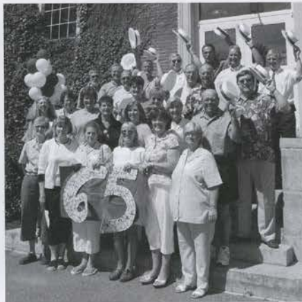
Class of 1965