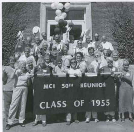
Class of 1955