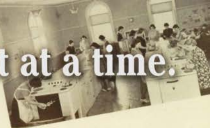
HOME ECONOMICS LABORATORY