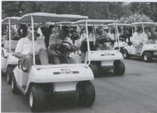
Players take off in an army of golf carts as the Alumni Open 2005 begins