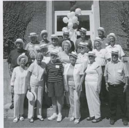
Class of 1950