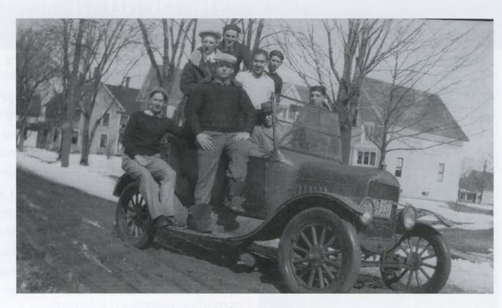
MCI boys, 1926

Phone: 207-487-5915; fax: 207-487-3512; e-mail: alumni@mci-school.org