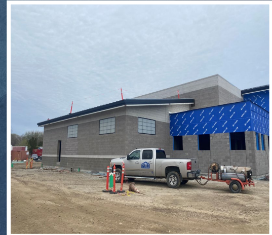
Translucent Panel Install