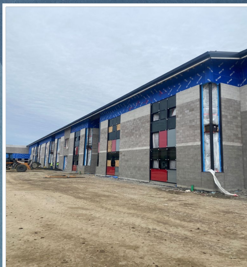
Southside Exterior Progress