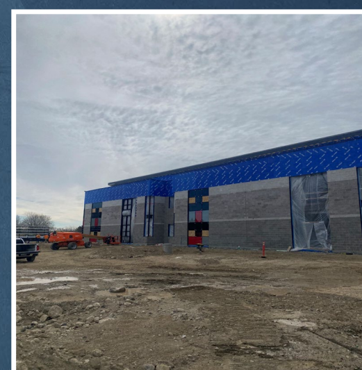
Northside Exterior Progress