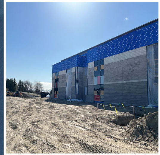
Curtain Wall Install Ongoing