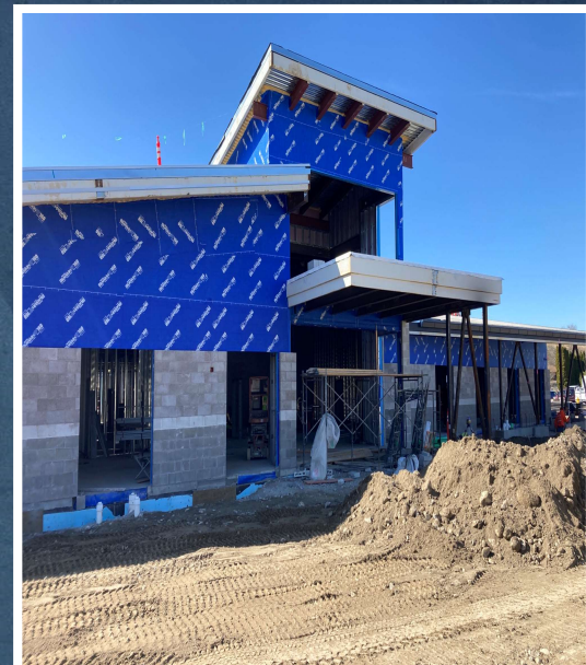
Main Entry Exterior