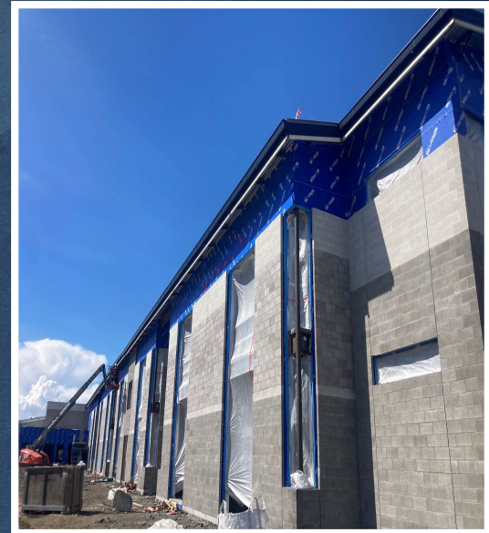
Brick Veneer South Elevation