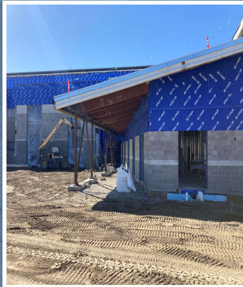
Admin Area Exterior