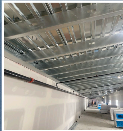
L3 Mezz Piping Install Ongoing