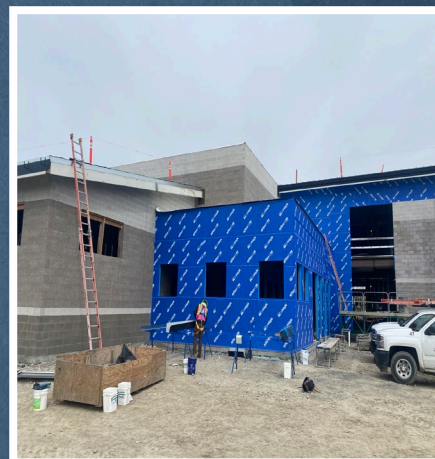
RP-1 Blueskin Complete