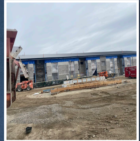
Metal Roofing Complete Classroom Wing