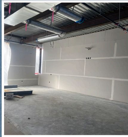
L1 Classroom Drywall