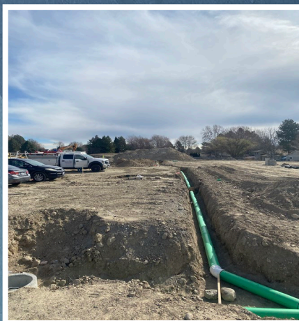
Site Utilities Ongoing