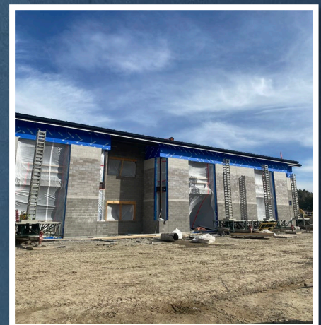
South Elevation Veneer