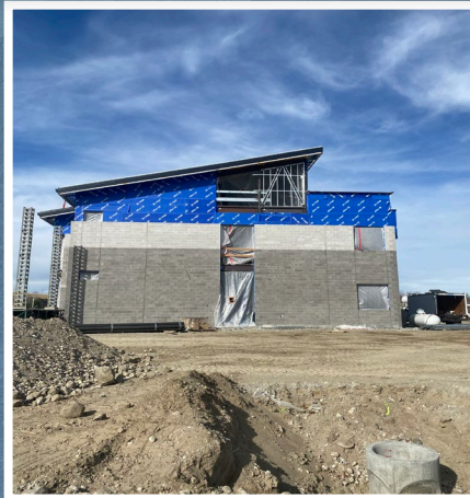
East Elevation Veneer