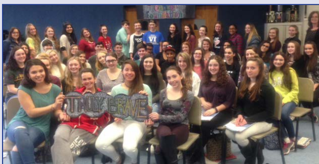
The Select Chorus held a Pediatric Cancer Fundraiser in December 2015. In total, the group donated $850.00 through bracelet and bake sales!