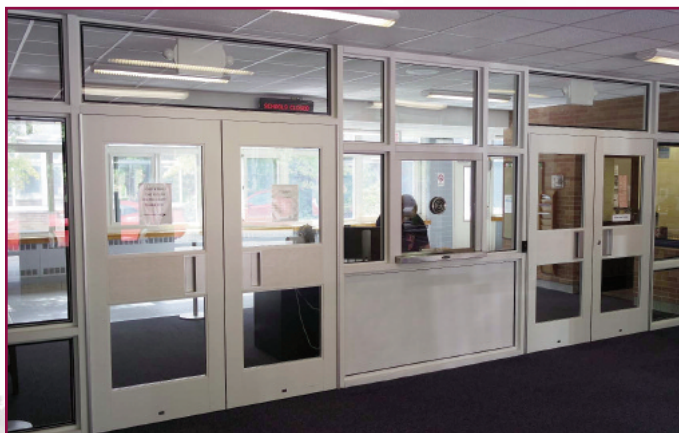
At AMPS, a reconstructed security vestibule and new transaction window will provide upgraded security, and a full roof replacement was completed as well.

With this new school year comes the successful completion of numerous facilities projects throughout our District. Projects have been completed at all four of our schools, from improving the security vestibules at Andrew Muller Primary School and Laddie A. Decker Sound Beach School; to roofing, site improvements and gymnasium upgrades at North Country Road Middle School; to an upgraded auditorium, weight room, heavy duty lockers, and stadium/lighting upgrades at Miller Place High School. For a complete list and pictures of all of our recent facilities projects, please visit a more detailed description on our website.