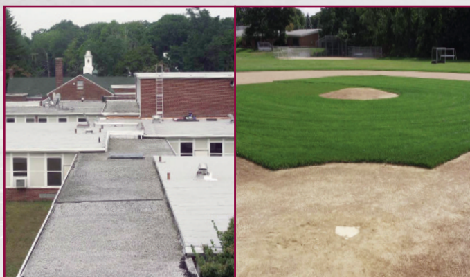
A partial roof replacement and new baseball fields are complete at NCRMS.