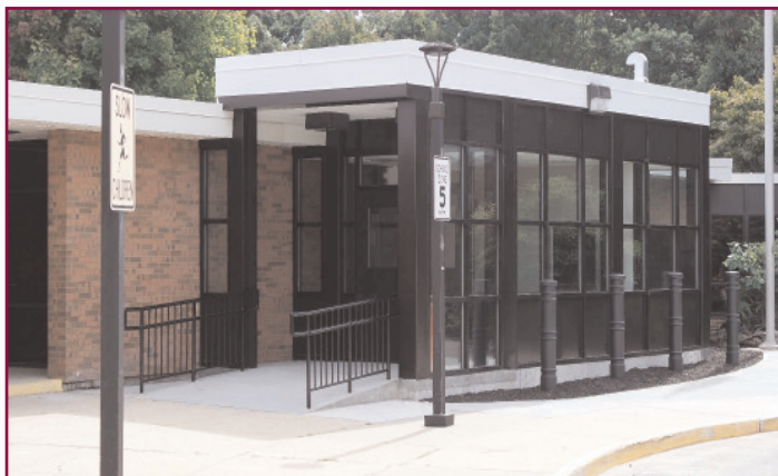
Work at LADSBS included a new security vestibule, main entrance and main entrance transaction window. A new playground will be installed in Spring 2016.