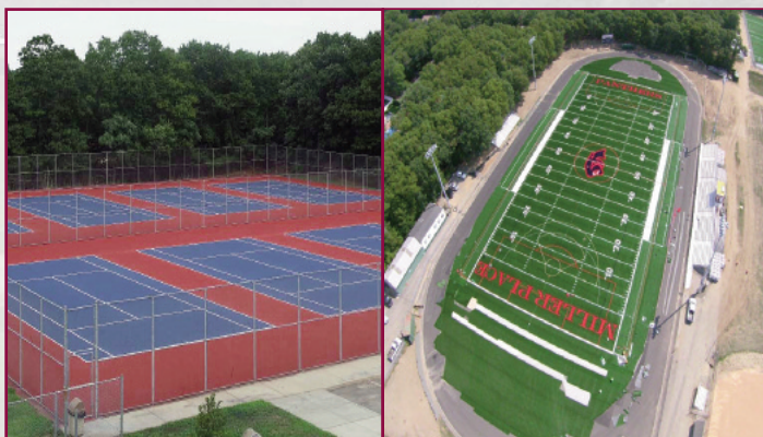
This year, MPHS has upgraded tennis courts and baseball/softball fields, in addition to a new multi-sport stadium and track.