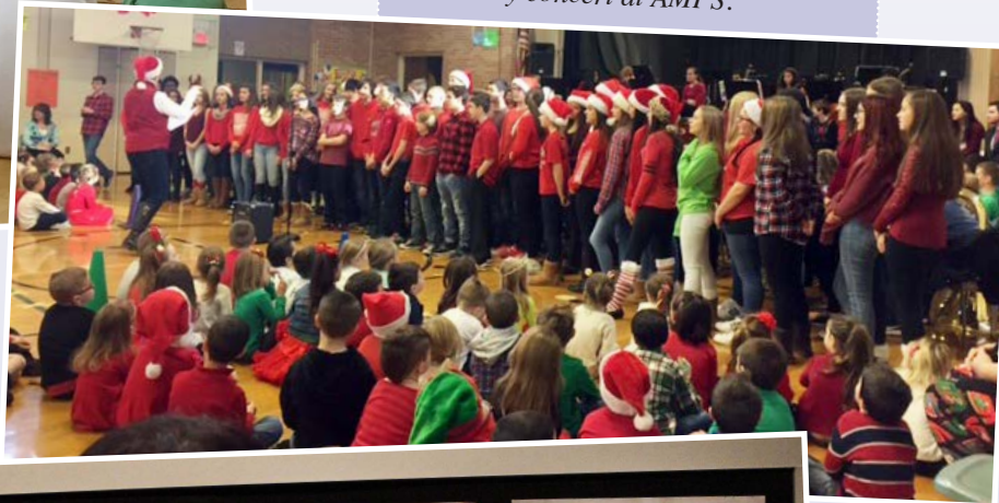
NCRMS student-musicians performed a holiday concert at AMPS.