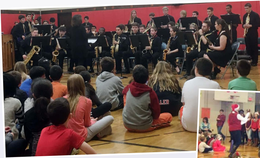
Miller Place HS Instrumental and Vocal Jazz Ensembles performing at a fifth-grade assembly at LADSBS.

Pictured below are MPHS vocal jazz students performing for an assembly for LADSBS students and SCMEA Jazz Day, in addition to some pieces of art created by Miller Place students this school year!