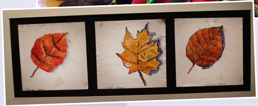
Grace Steele, NCRMS, Colors of Long Island Show 2017