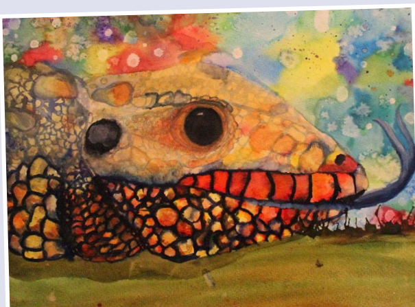
Ivy Newman, NCRMS, Colors of Long Island Show 2017