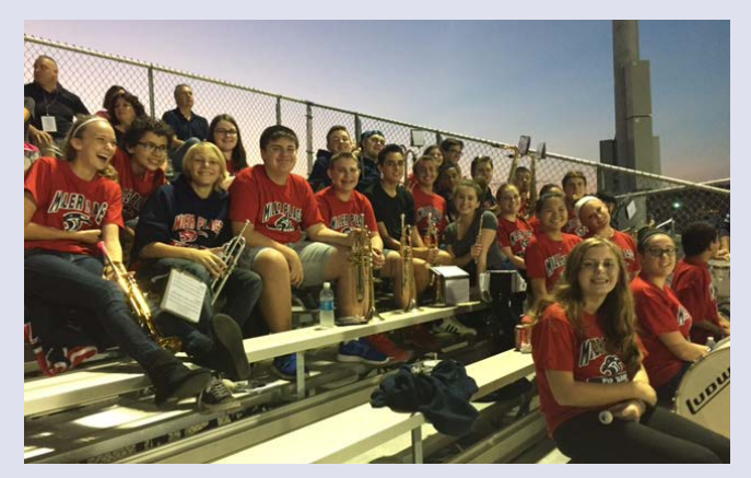
The Miller Place Pep Band!