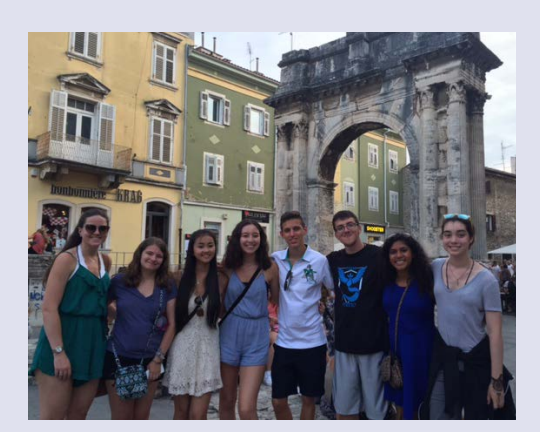
Miller Place studentmusicians performed in Europe with an American Music Abroad program.