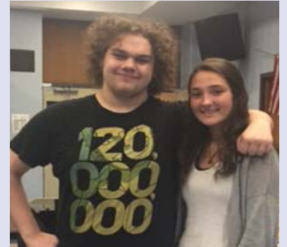
All-State studentmusicians from Miller Place!