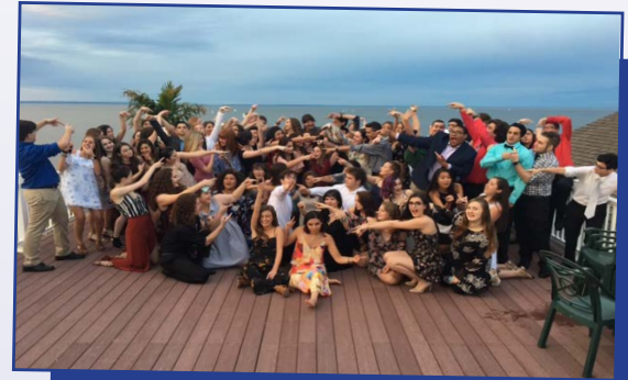
Miller Place High School Panther players celebrating at their end of the year dinner!