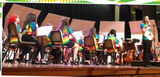
Laddie A. Decker Sound Beach students performing at Ducks Stadium.