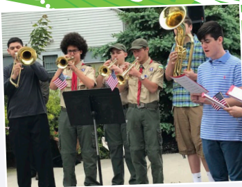
Miller Place High School vocalists and instrumentalists at the Sound Beach Memorial Day Ceremony.