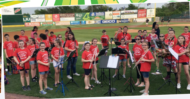
North Country Road Middle School 6th grade orchestra.