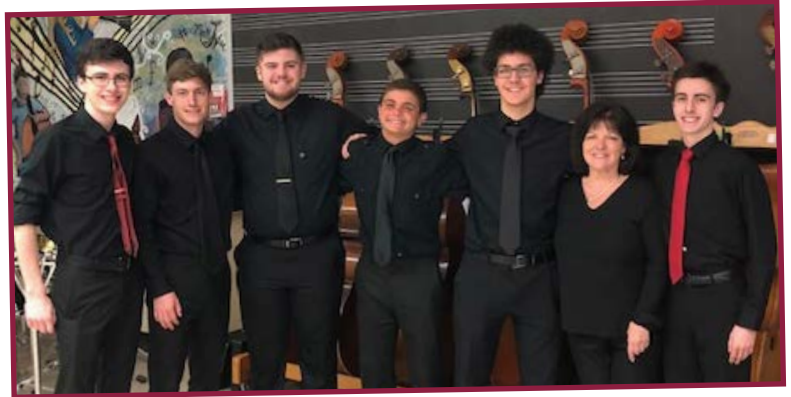
Miller Place High School SCMEA All-County jazz musicians.