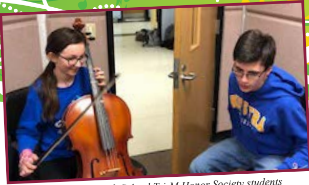
Miller Place High School Tri-M Honor Society students mentoring at North Country Road Middle School for the upcoming NYSSMA solo and ensemble adjudications.