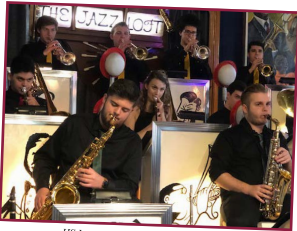
HS Instrumental Jazz at The Jazz Loft.