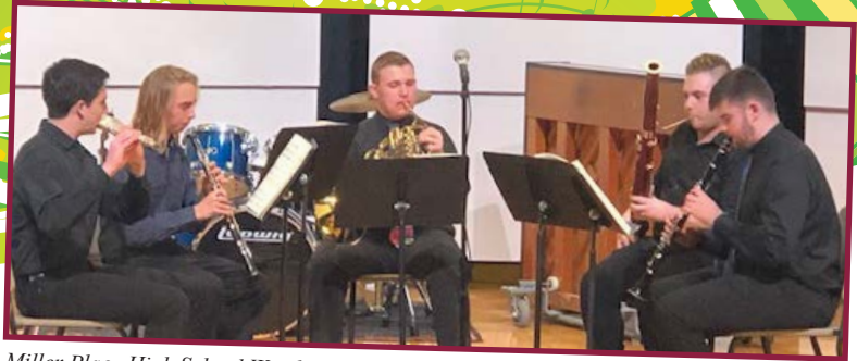
Miller Place High School Woodwind Quintet playing at the high school's music showcase.