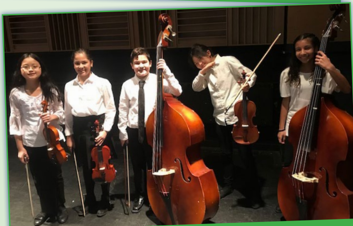
NCRMS sixth-graders attending the Long Island String Festival