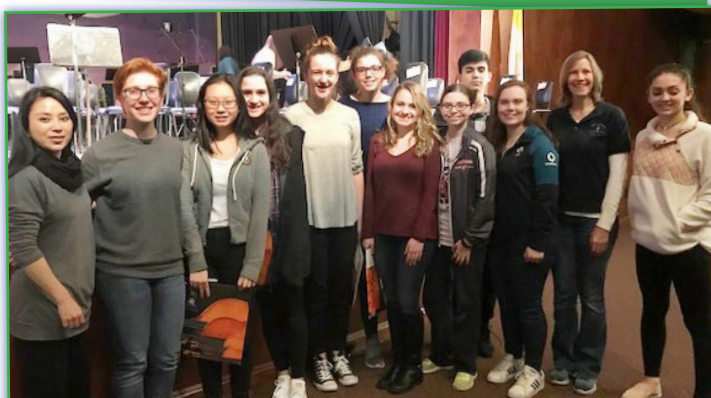
Secondary LISFA students with composer/conductor/actress Soon Hee Newbold