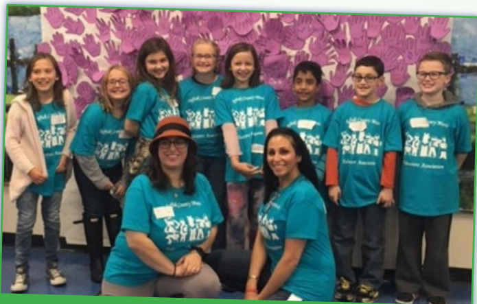
Fourth-graders from LADSBS attending the PEAK Festival