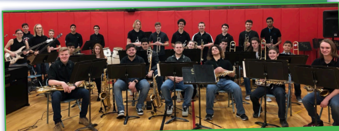
High school Instrumental Jazz performing at LADSBS