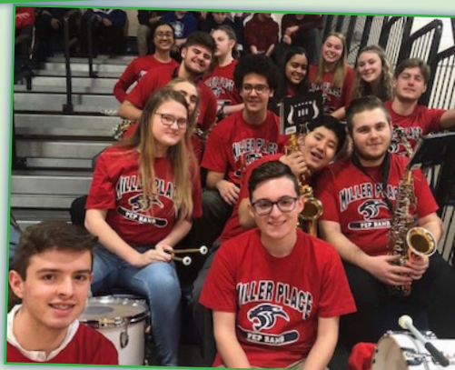
Pep band at basketball game