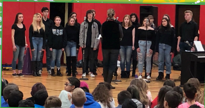
High school Vocal Jazz performing at LADSBS