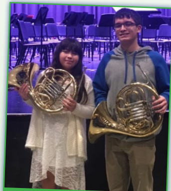
District students attending SCMEA Day of Horn