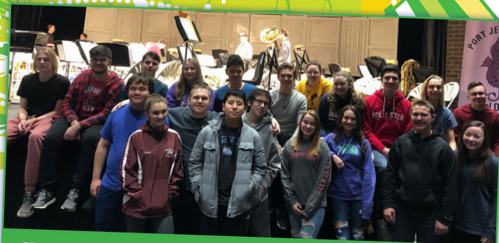
High school student participants in Mid Island Band Festival