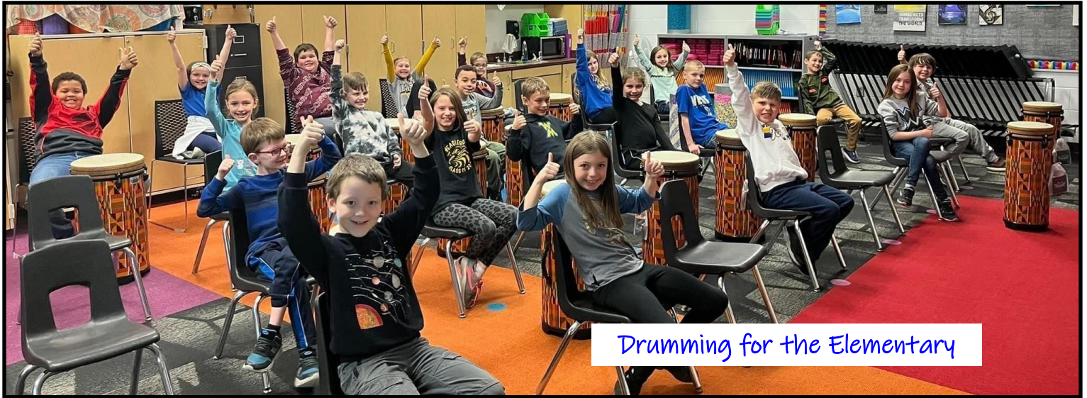
Drumming for the Elementary