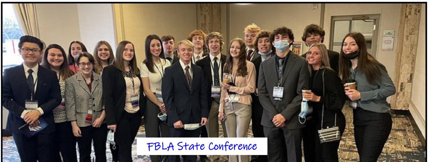
FBLA State Conference