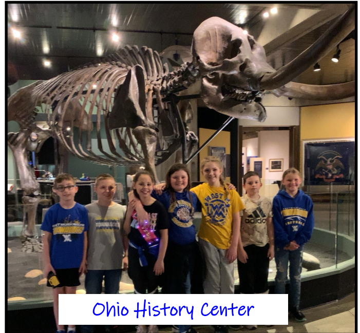
Ohio History Center