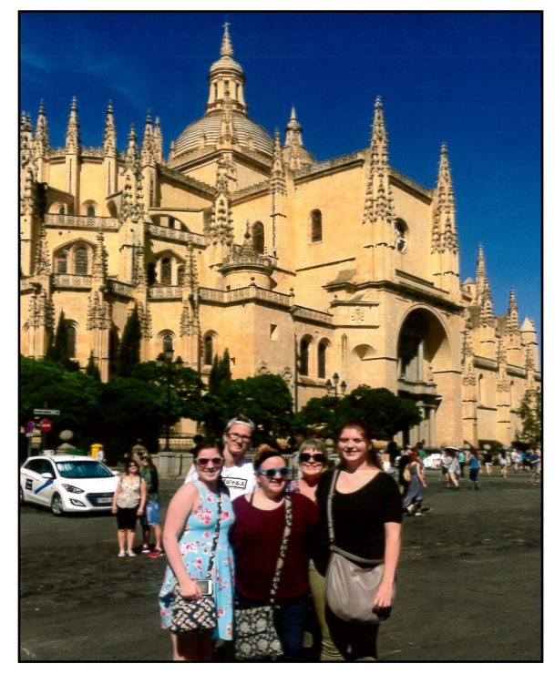
Pictured are the Plaza Mayor (top left); Zaragoza (bottom left), and Segovia's Cathedra (above).

This has been an exceptional trip and we all thank you so much.