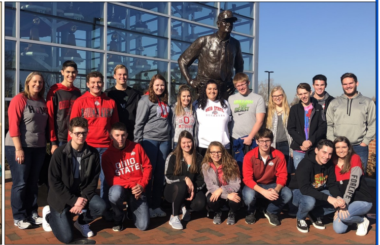
The Kinesiology and Sports Medicine classes visited The Ohio State University Woody Hayes Complex and Athletic Training facilities. Students participated in hands-on activities with local experts in the field of athletic training and sports medicine, and spoke with professors and students about the programs.