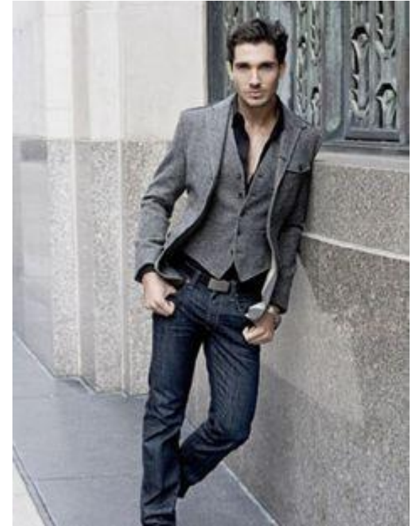
No dress pants; shirt unbuttoned