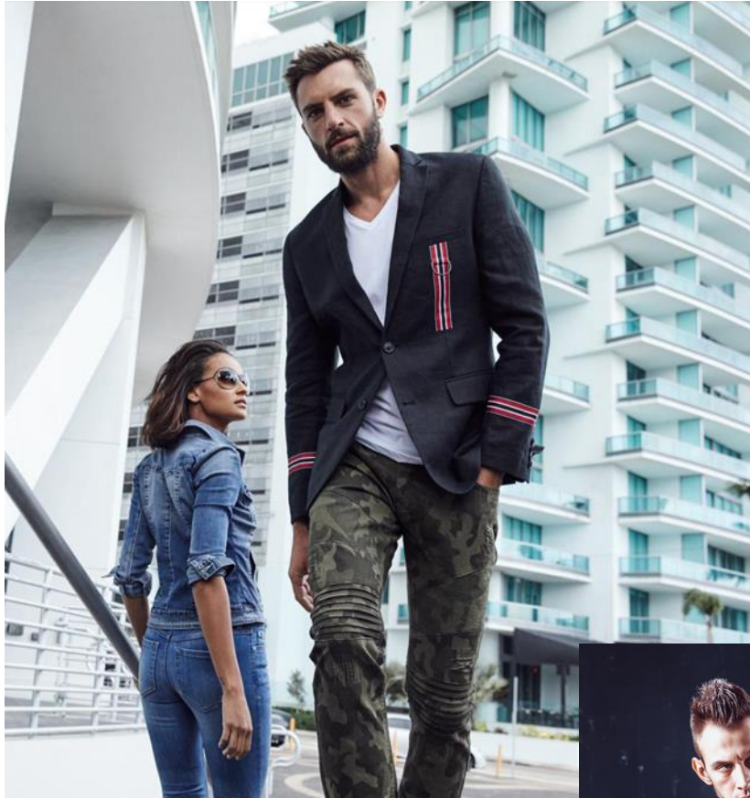
No dress shirt/pants