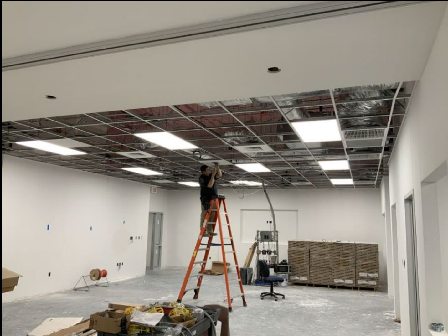
Installing fire alarm strobes in the ceiling tiles.