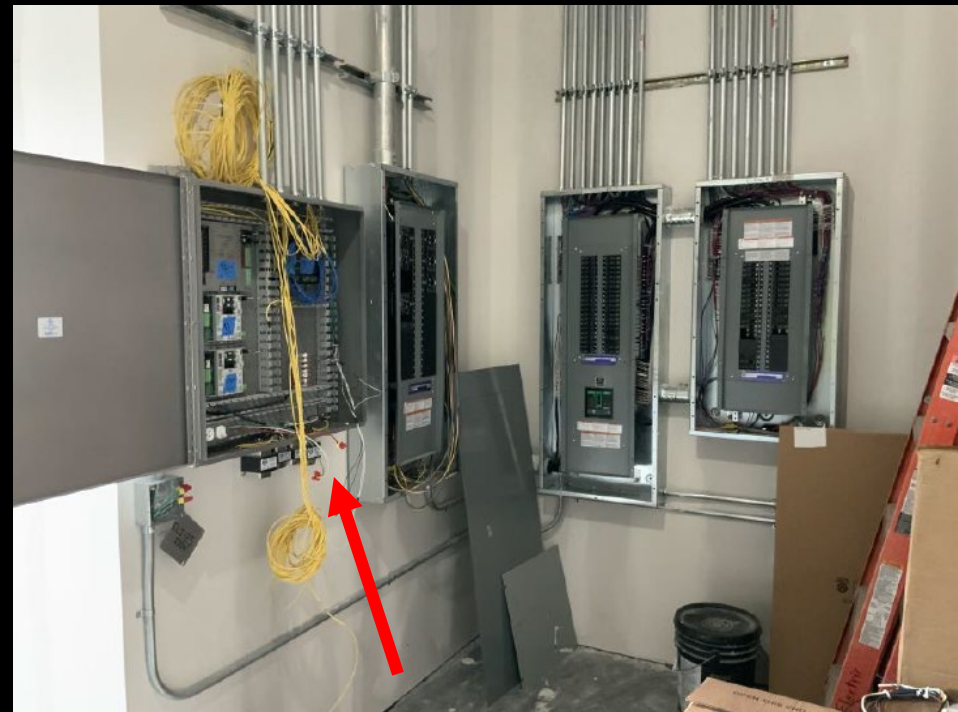
Building Automation System Panel:

Connecting electrical wires to the breakers in the electrical panels and in the Building Automation System Panel.