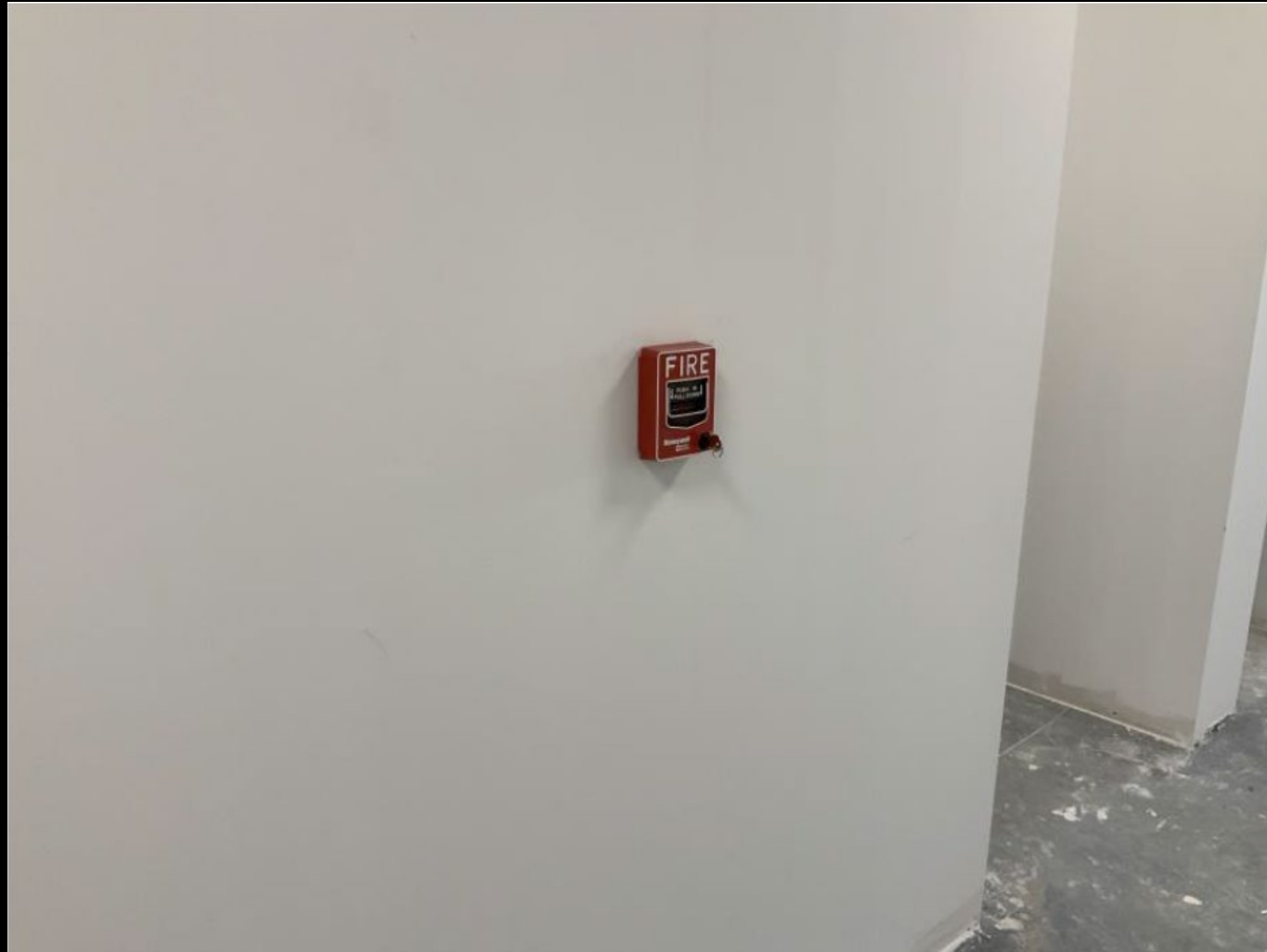
Installed fire pull stations.