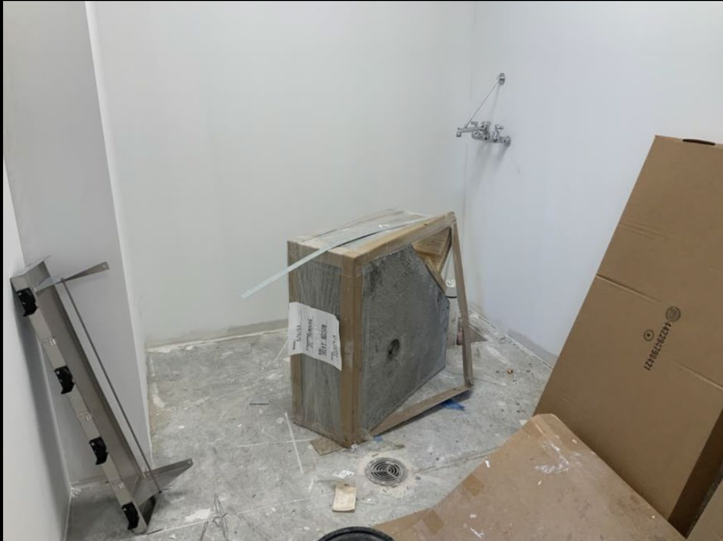
Custodial mop sink delivered and ready for installation.