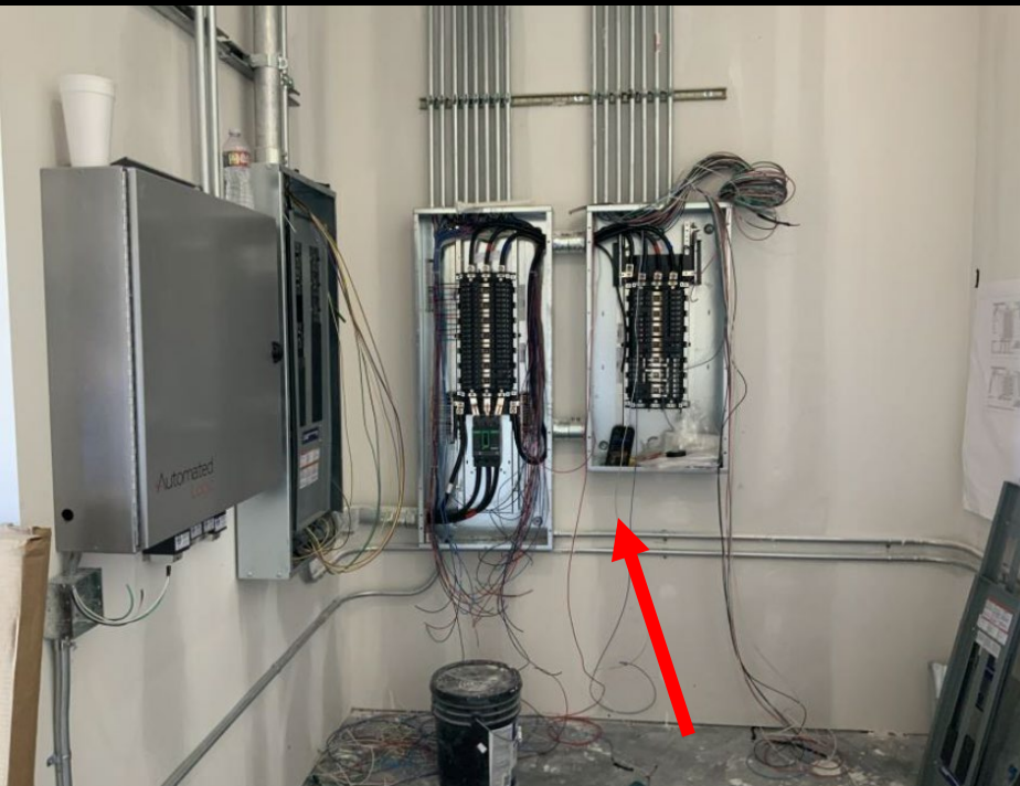
Electrical Panels and Breakers: