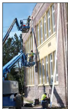
Brick repair work.

Kirk designers selected concrete masonry as the primary exterior finish of the new school. The decision provided a savings of 30% over other materials. Concrete masonry units will also provide the school with long-term durability. A complete list of awards was published in the Seattle Daily Journal of Commerce.