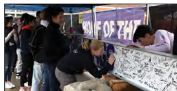
Students signed the last beam before workers lifted it to the top of the two-story structure. The addition will open in fall 2020. More photos: http://bit.ly/LWHSaddition

The work of long-range planning for future critical capacity work continues. LWSD has convened a Facilities Advisory Committee to make recommendations on future facilities needs across the district. The committee will meet throughout the 2019-20 school year and plans to make recommendations to the School Board in June 2020.