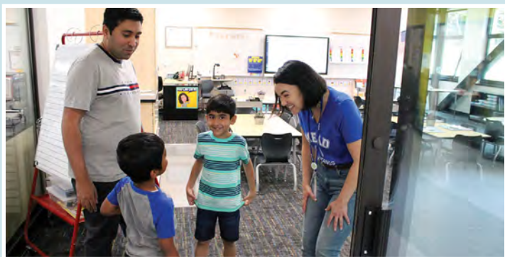
Two friends were excited to see each other during Mead Elementary's Meet and Greet on August 30. It was the first opportunity for families to see the new building.