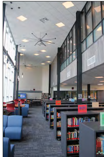
The first phase of Juanita High School opened for students and staff in September 2019. The library, Performing Arts Center, commons and some instructional spaces are complete. An additional instructional wing will open in September 2020. To see more photos and videos, visit: www.lwsd.org/jhs-rebuild .