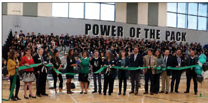
Ribbon-cutting ceremony at the new Timberline Middle School in October 2019.