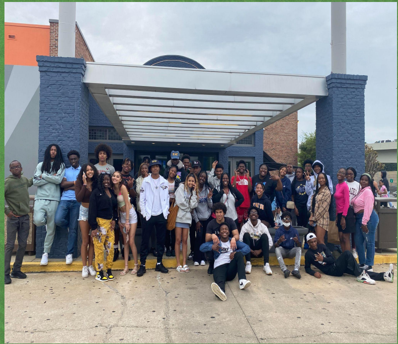
Building friendships to last a lifetime!