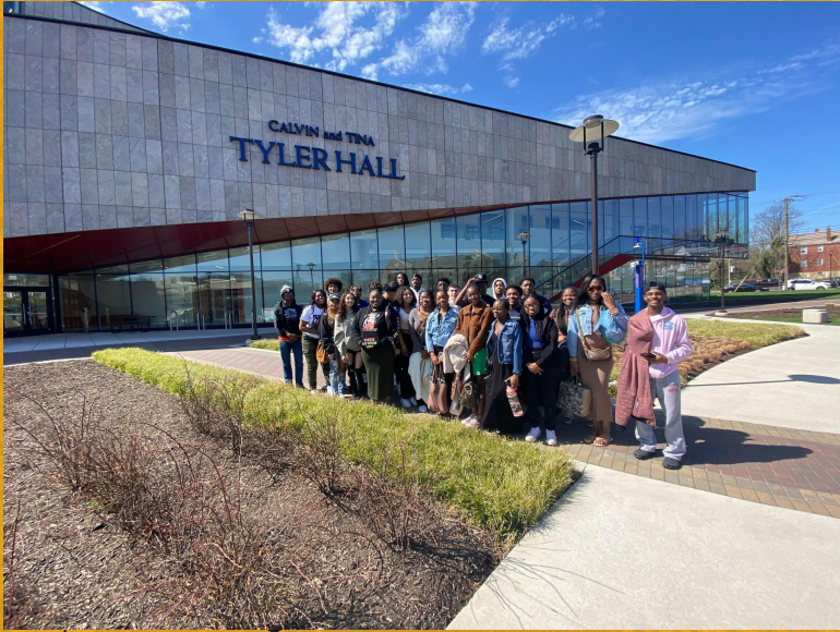
Morgan State University