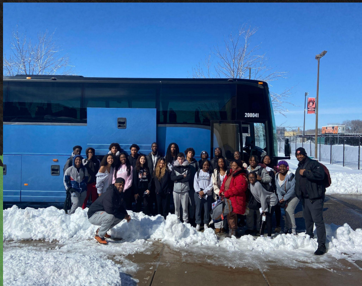
WBL Students heading out from South campus!