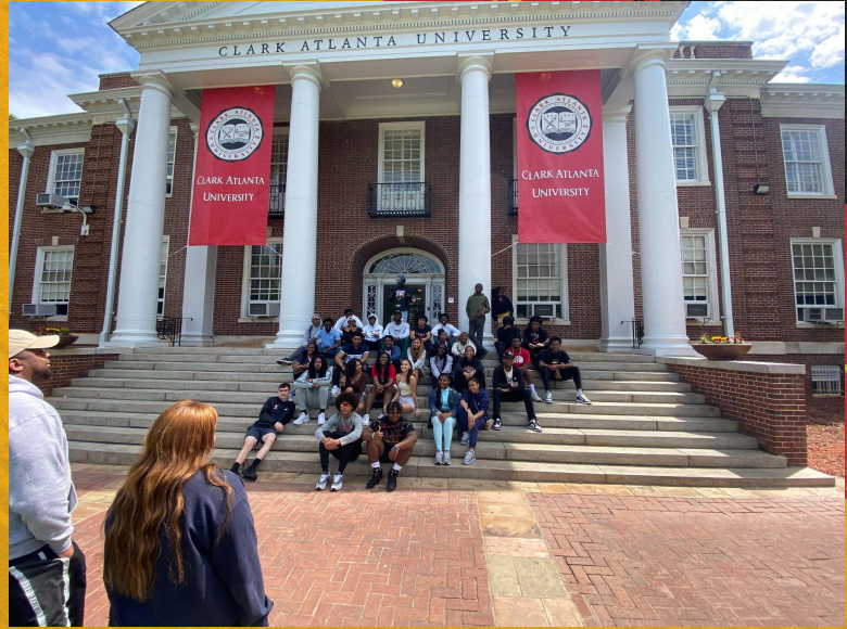
Clark Atlanta University