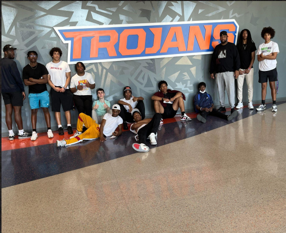
Virginia State University