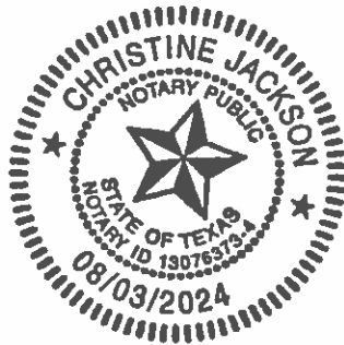
Signature of Candidate or Officeholder

18 SIGNATURE I swear, or affirm, under penalty of perjury, that the accompanying report is true and correct and includes all information required to be reported by me under Title 15, Election Code.